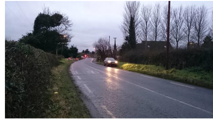
VIEW TOWARDS LEFT (SOUTH) FROM PROPOSED SITE EGRESS ON CLONSHAUGH RD