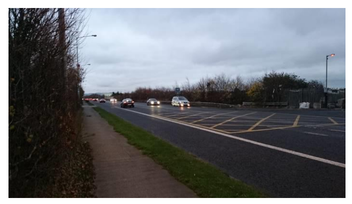
VIEW TOWARDS LEFT (EAST) FROM PROPOSED SITE ACCESS ON R139