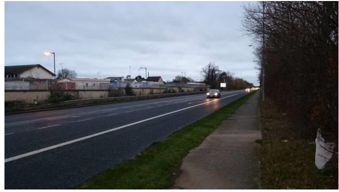
VIEW TOWARDS RIGHT (WEST) FROM PROPOSED SITE ACCESS ON R139