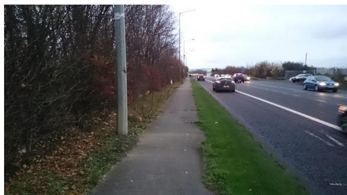
VIEW EASTWARDS ON APPROACH TO PROPOSED SITE ACCESS ON R139