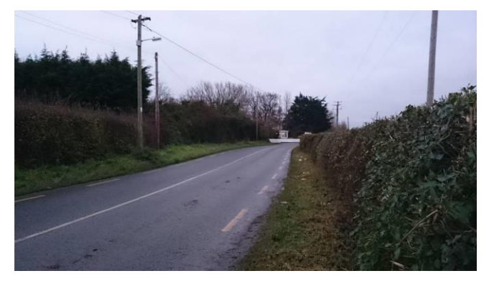
VIEW TOWARDS RIGHT (NORTH) FROM PROPOSED SITE EGRESS ON CLONSHAUGH RD