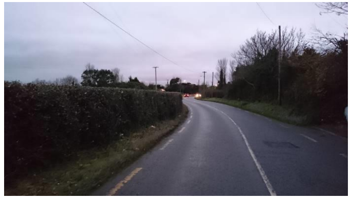
VIEW ON SOUTHBOUND APPROACH TO PROPOSED SITE EGRESS ON CLONSHAUGH RD